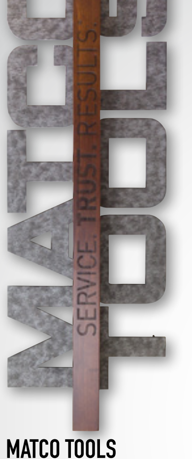
MATCO TOOLS WINE RACK

Hand finished laser cut steel lettering with wood bottle holder, holds up to 10 bottles. 12.5" W x 33" H x 4.75" D PDNV458