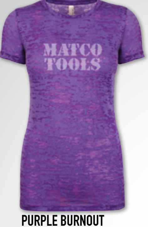
65% polyester / 35% combed ringspun cotton jersey. Screen print on front. Purple Crush PDLT63 (size) Sizes S-2XL