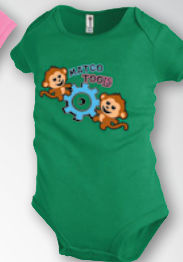
ONESIE 100% cotton, screen print on front. Green.