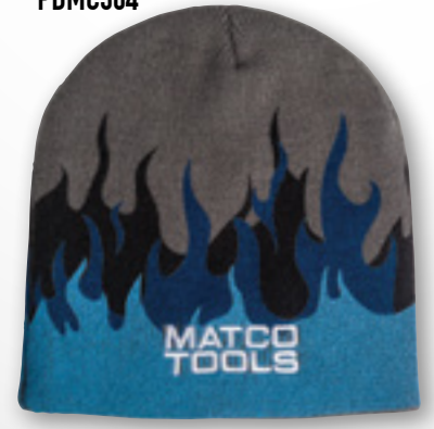
BLUE FLAME BEANIE