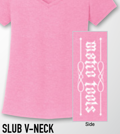
60% combed ringspun cotton, 40% polyester slub jersey. Screen print on the side. Neon Pink PDLT68 (size) Sizes S-2XL