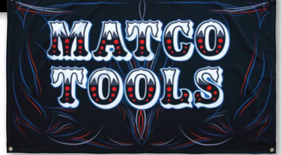
PINSTRIPE BANNER 5' x 3 ' 100% polyester with grommets. PDNV278