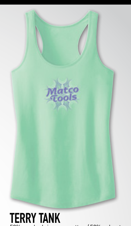
50% combed ringspun cotton / 50% polyester lightweight. Screen print on front. Mint PDLT66 (size) Sizes S-2XL