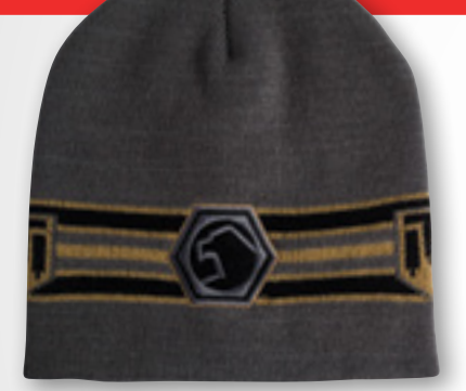
CHARCOAL STRIPE BEANIE