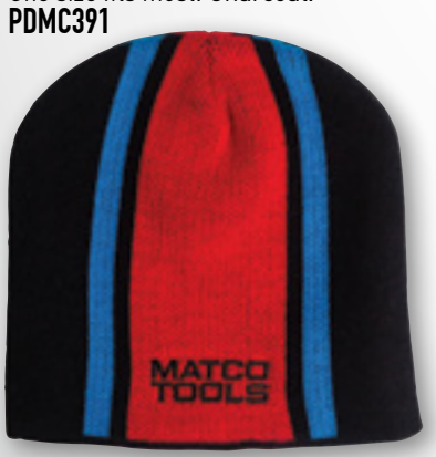
BIG RED STRIPE BEANIE