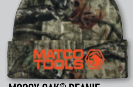
MOSSY OAK® BEANIE Matco Tools embroidered in blaze orange. One size fits most. PDMC329