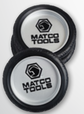
4-PIECE TIRE COASTER SET PDNV461

Hand finished laser cut steel lettering with wood bottle holder, holds up to 10 bottles. 12.5" W x 33" H x 4.75" D PDNV458