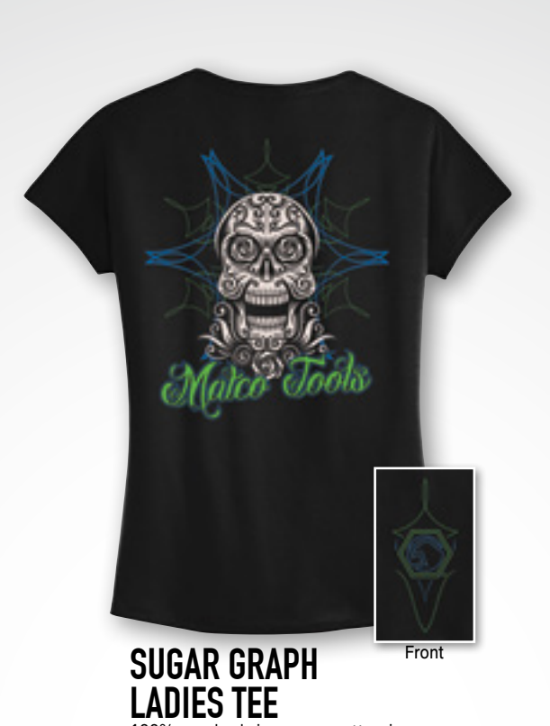
100% combed ring-spun cotton jersey. Screen print on front and back. Black PDLT69 (size) Sizes S-2XL