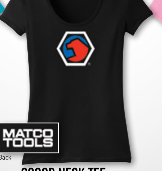
SCOOP NECK TEE 100% polyester, screen print on front and back. Black PDLT51 (size) Sizes S-2XL