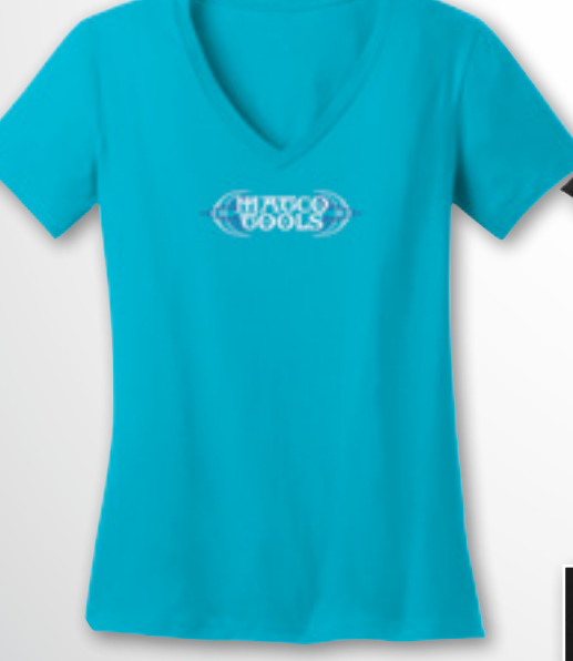
BONDI BLUE 60% cotton, 40% polyester jersey. Screen print on front. Bondi Blue PDLT67 (size) Sizes S-2XL