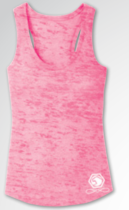
RACERBACK BURNOUT TANK 65% polyester / 35% combed ringspun cotton. Screen print on hip. Pink PDLT64 (size) Sizes S-2XL