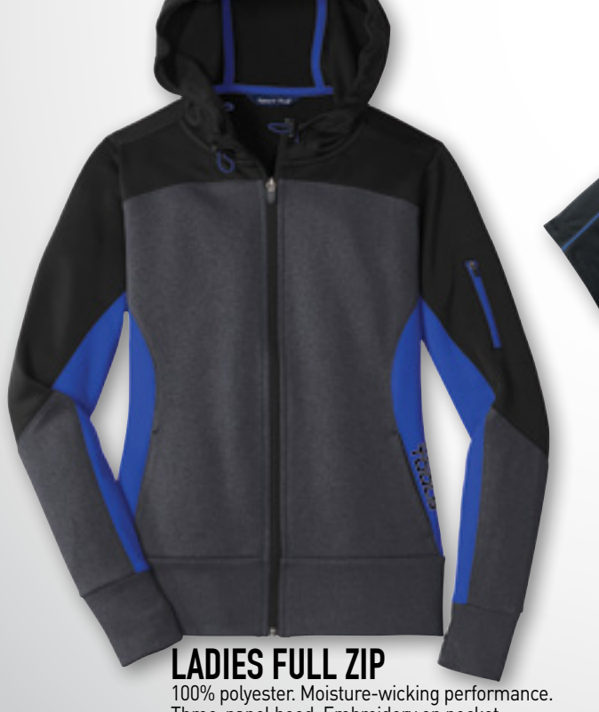
100% polyester. Moisture-wicking performance. Three-panel hood. Embroidery on pocket. Black/Gray/Royal PDLJKT25 (size) Sizes S-2XL

100% polyester tricot. Moisture wicking. Embroidery on front. Black/royal PDLP5 (size) Sizes S-2XL