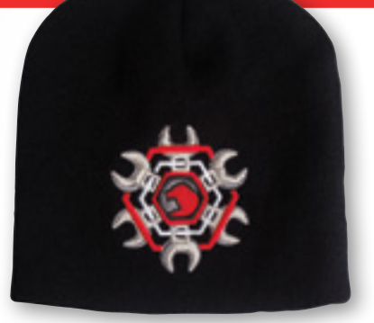
HEX WRENCH BEANIE